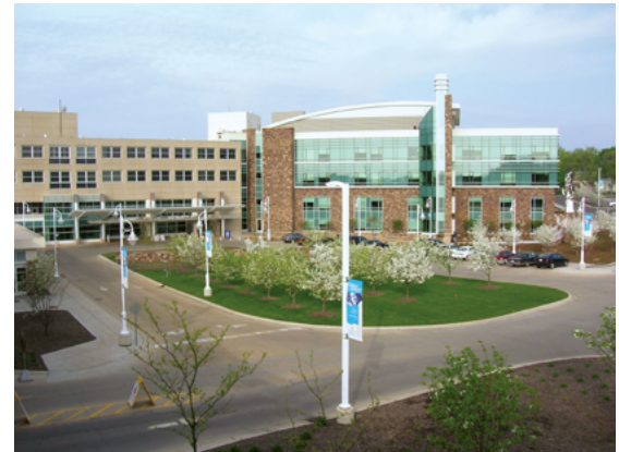
Radiologists at Lakeland Health led an effort to develop a patient-based radiation safety program.

childhood and subsequent risk of leukemia and brain tumours: a retrospective cohort study. Lancet . Aug. 2012;380(9840):499-505.